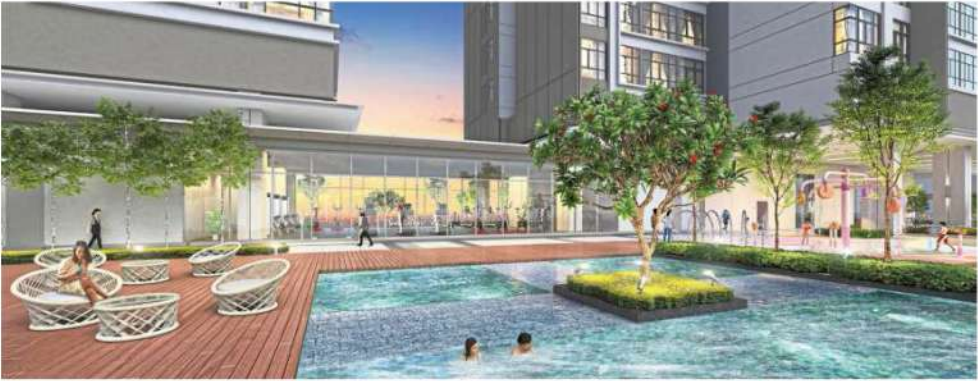
The Maple Residences by WCT Land Sdn Bhd