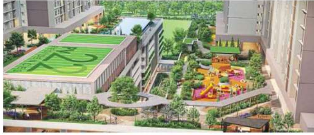
PV22 Residences by Platinum Victory