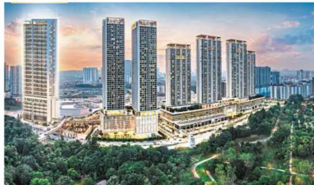
Park Green Pavilion Bukit Jalil by Malton Berhad