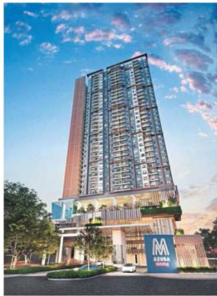
M Azura by Mah Sing Group Berhad