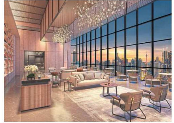
The Ashwood by Paramount Property