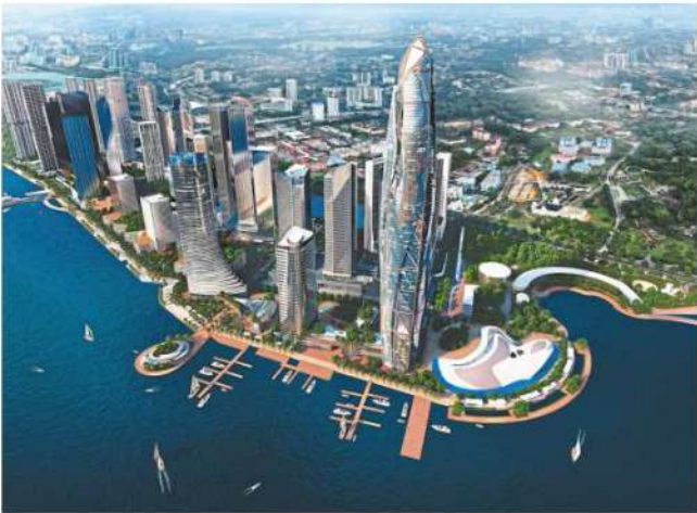
LIDO Waterfront Boulevard by Tropicana Corporation Berhad