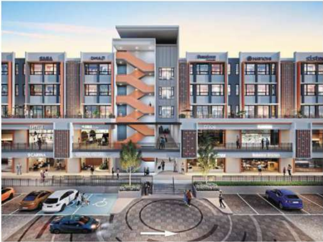
Roam @ IJM Rimbayu by IJM Land Berhad