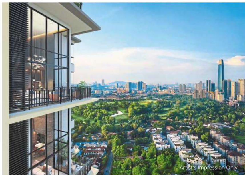
Bask in the captivating Royal Selangor Golf Course view from your balcony.

For more information, please visit https://paramountproperty.my/developments/the-ashwood .