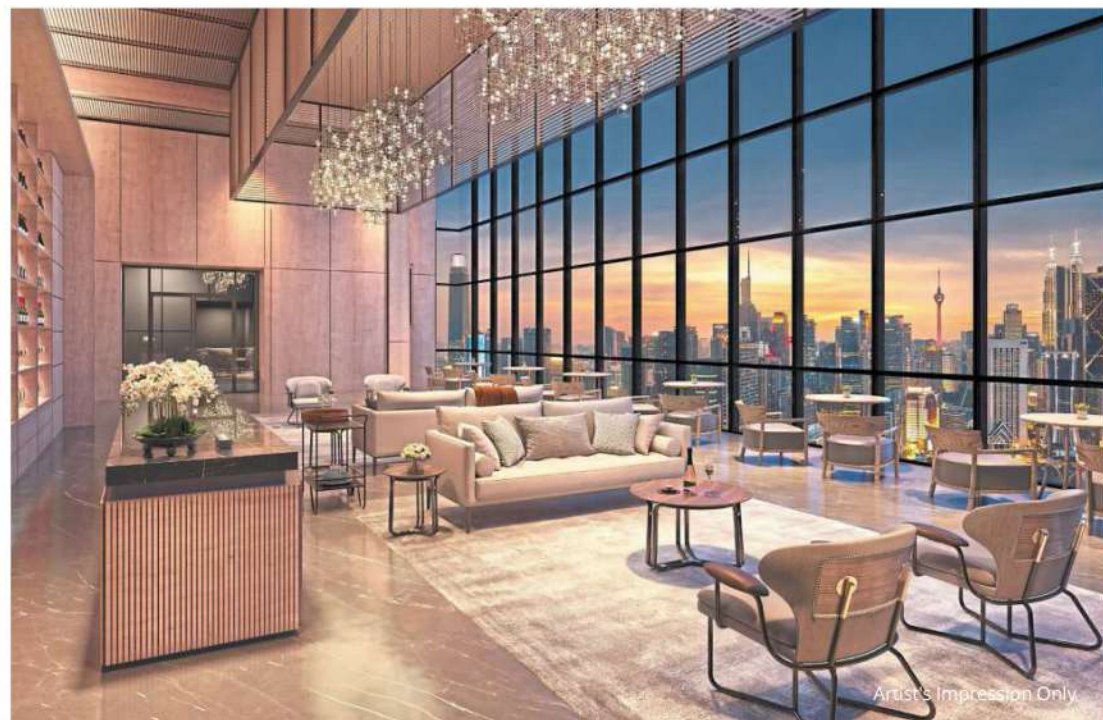
The sky lounge at level 49 warmly welcomes its residents home.

The Ashwood is redefining prestige living in Kuala Lumpur