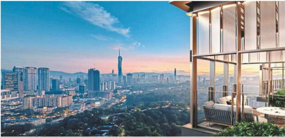
Aetas Seputeh by Avaland Berhad