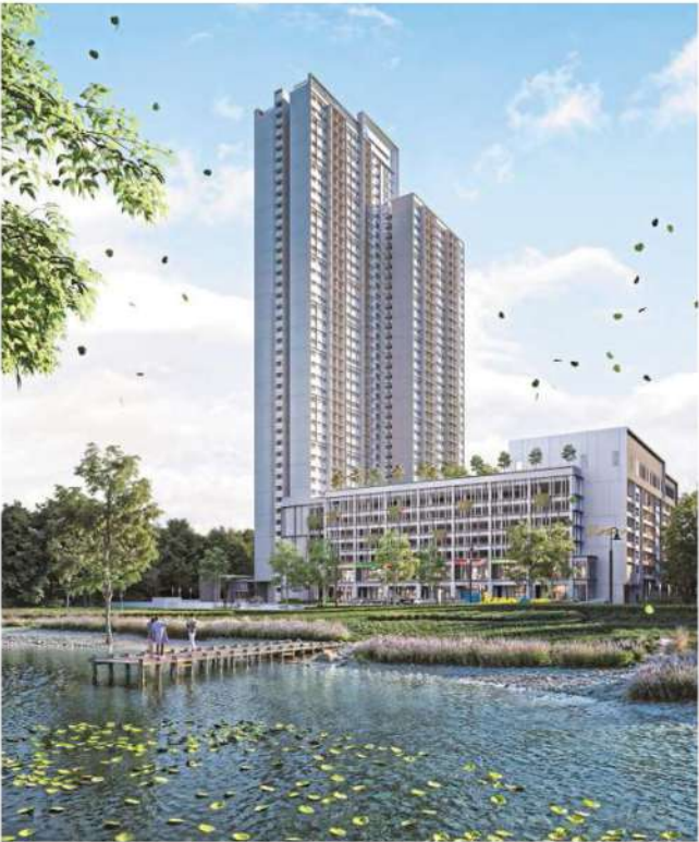
Mori Residences 3 by Scientex Berhad