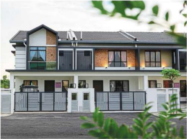
Oskar Residence @ Forest Heights by Sunrise MCL Land Sdn Bhd