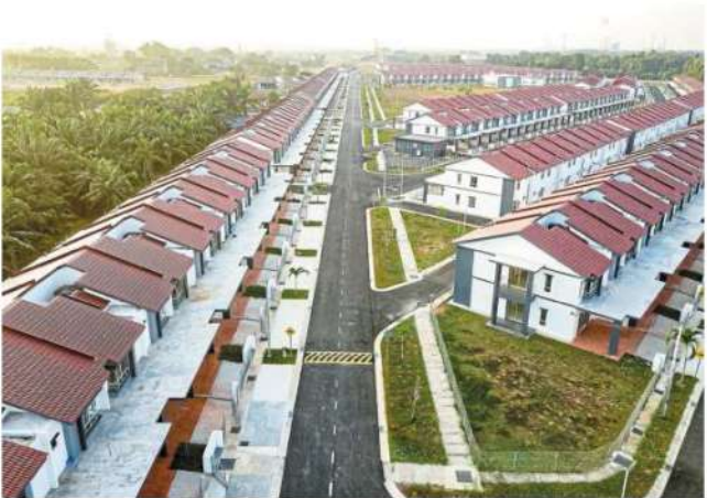
Residensi Port Dickson by Perbadanan PR1MA Malaysia