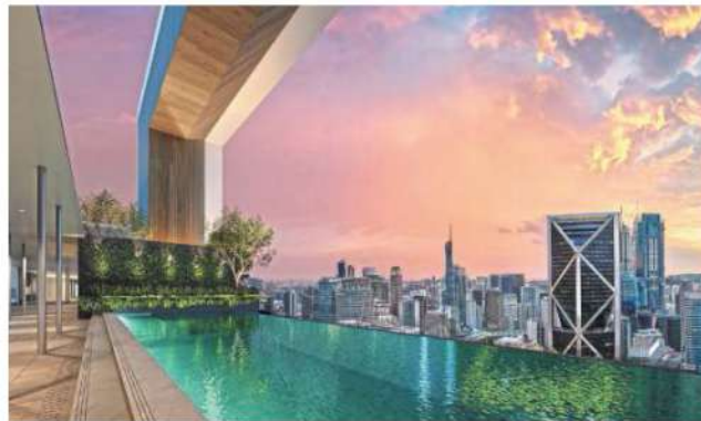
Skyline Embassy by TSLAW Land