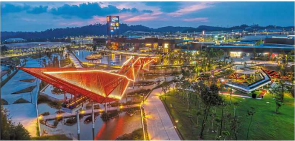
Elmina Lakeside Mall & Urban Park, City of Elmina by Sime Darby Property Berhad