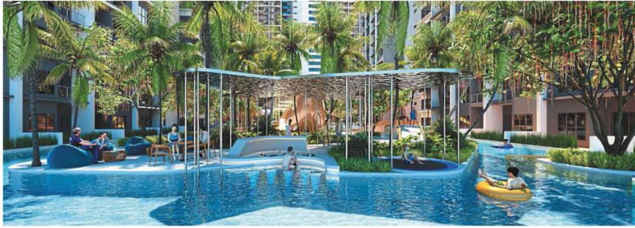
Residensi Cove @ Kota Syahbandar by KEB Group Of Companies