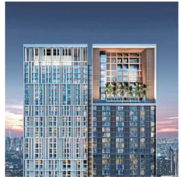
Chancery Ampang SOHO by Radium Development Berhad