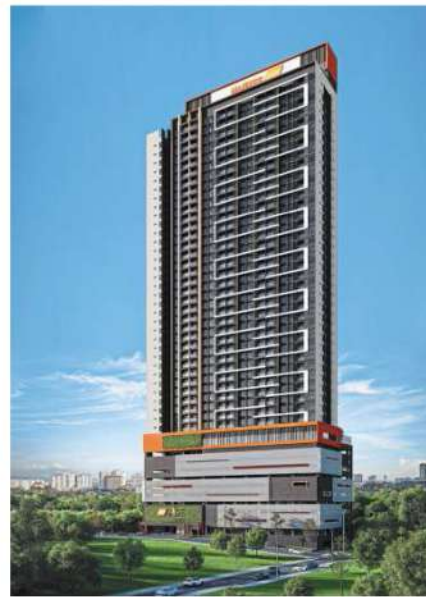
Gen Rise by Majestic Gen Sdn Bhd