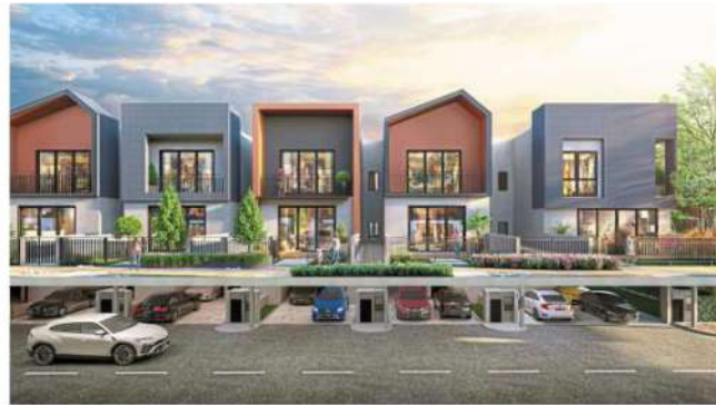
22 Quartz Residences by Mitraland Group