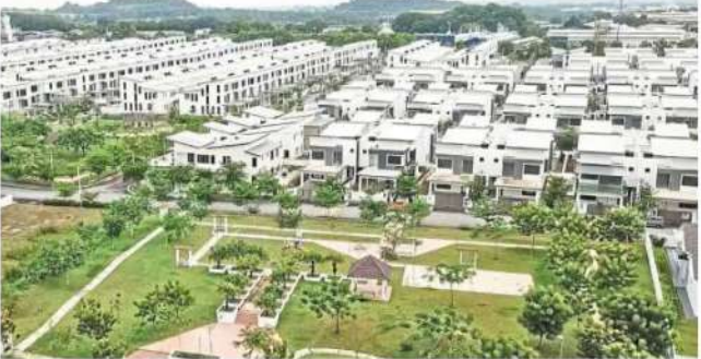
Taman Ozana Residen by PDG Property Group