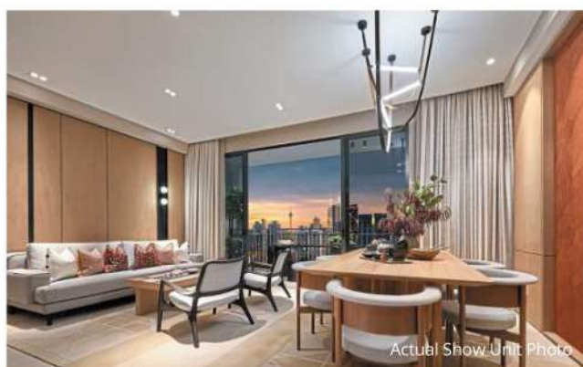
The wide and spacious design offers flexibility for a variety of interior layout configurations.

STARPROPERTY ALL-STARS AWARD (LISTED TOP 10)