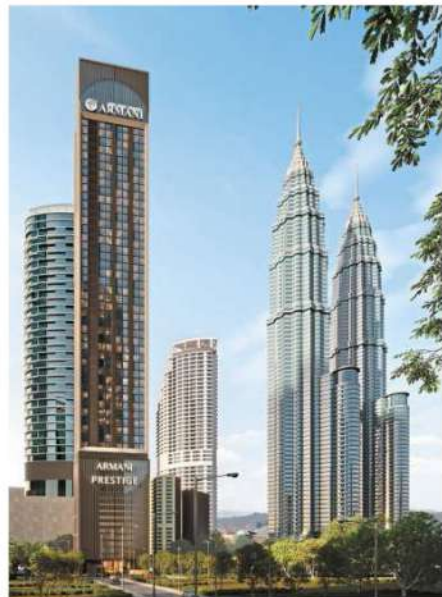
Armani Prestige by Armani Group