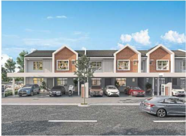
Aludra Residensi by Perbadanan Kemajuan Negeri Selangor (PKNS)