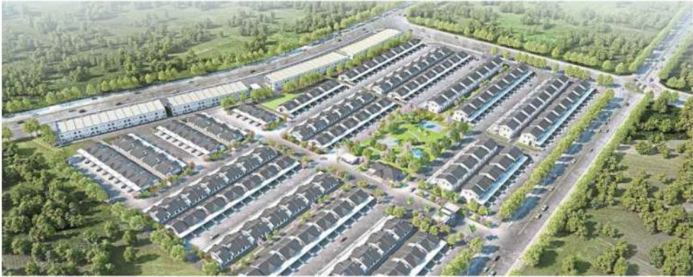
Taman Gapam Perdana by Teladan Group Berhad