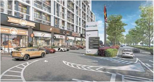
e.Sentral SmartCity @ Damansara West by HCK Capital Group Berhad