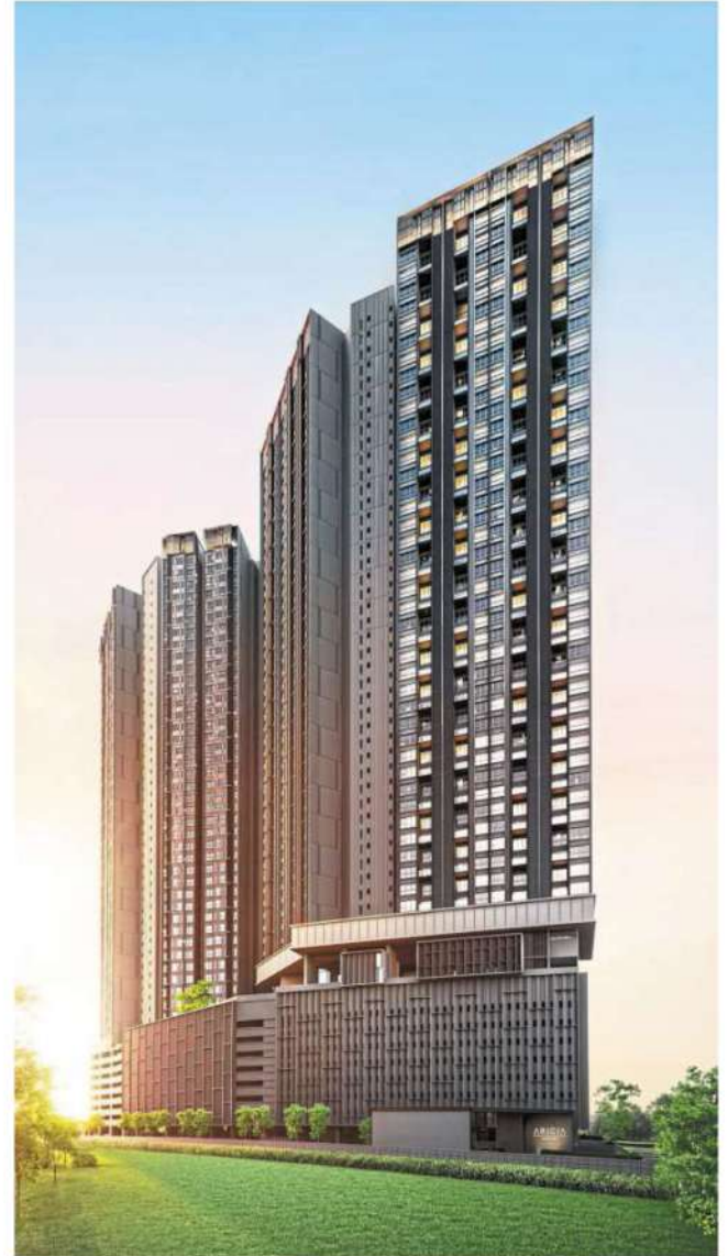
Aricia Residences by Chin Hin Group Property