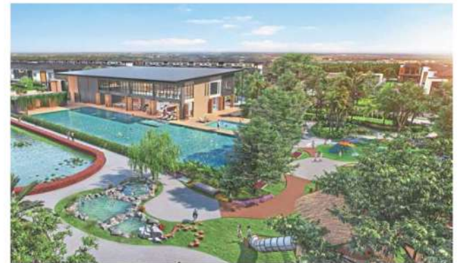
Sutera Garden Village by Tanah Sutera Development Sdn Bhd