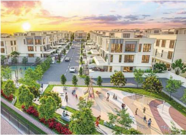
Erica Residence by AYER Holdings Berhad