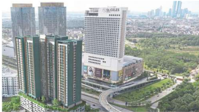
Southkey Nadi Residences by Southkey City Sdn Bhd