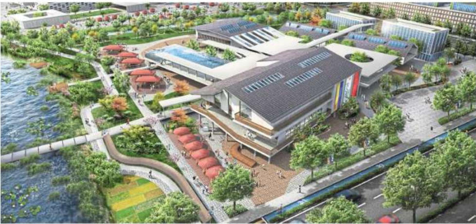
Bandar Tiram by JLand Group Sdn Bhd