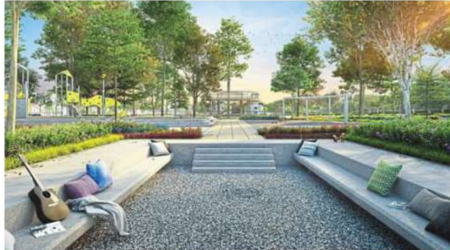
EKA Heights by Matrix Concepts Holdings Berhad