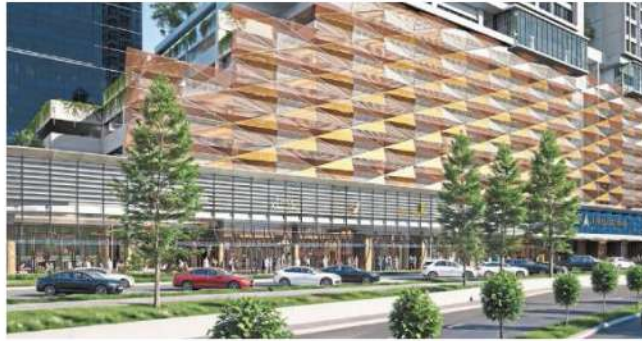
Parkland Avenue by The Sea by Parkland