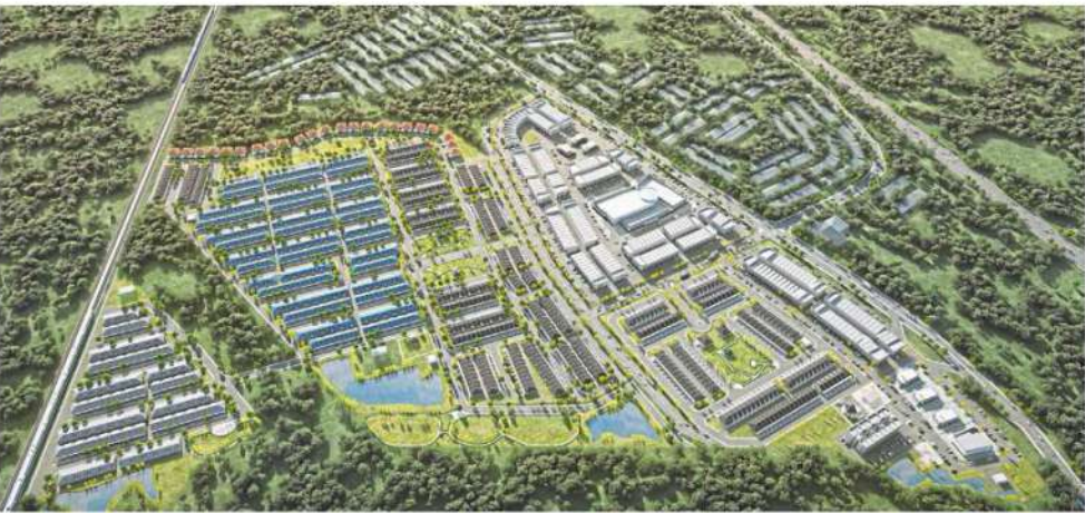
AERA Gardens by Hgd