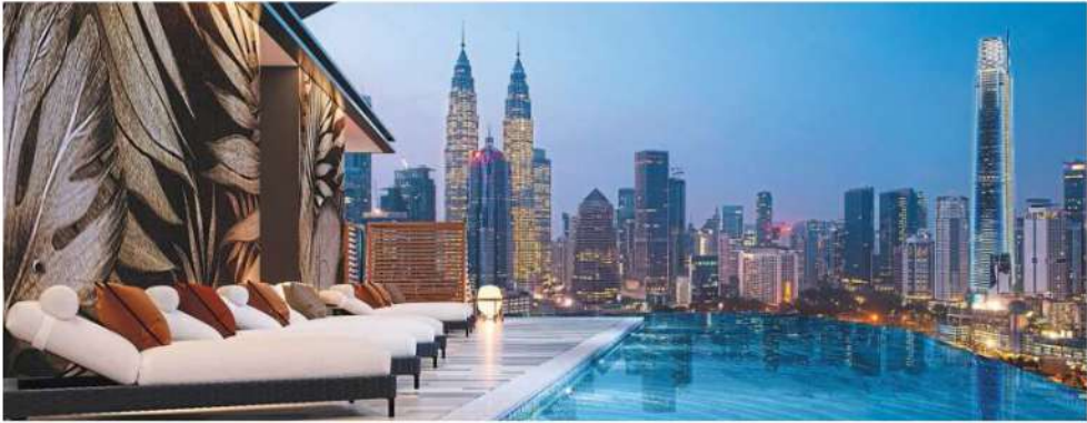
SKYLON Residences by GBD Land