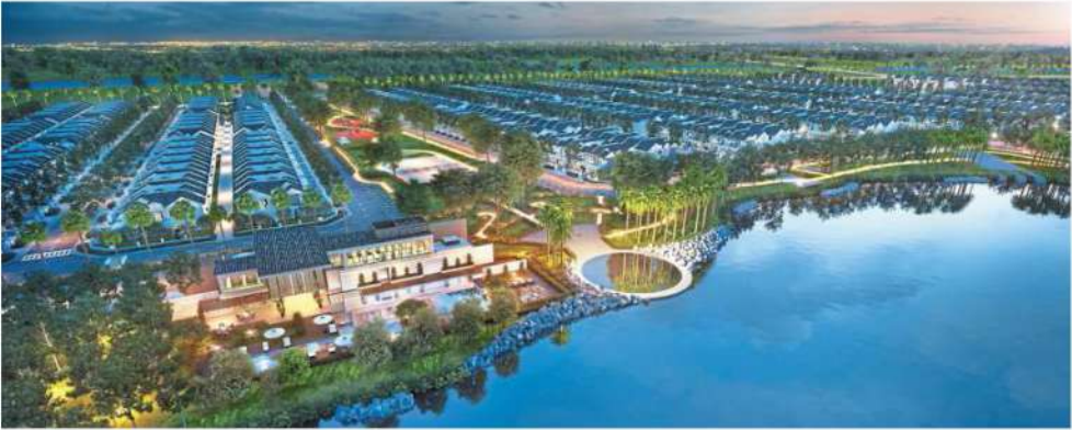
Keys Lakeside Residences by Glomac Berhad