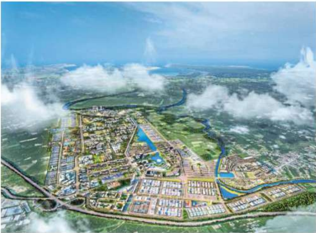
Bandar Universiti Pagoh by Sime Darby Property Berhad