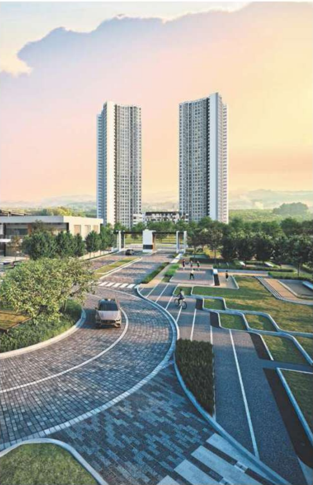
Kayana Heights by KTI Landmark Berhad