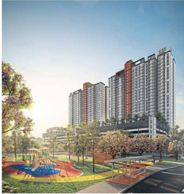
Nara At Shorea Park by OSK Property